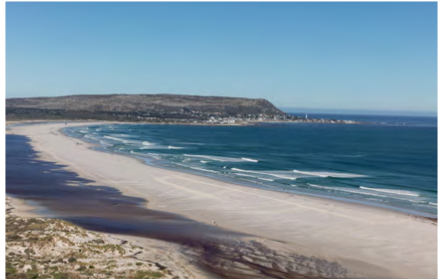
Noordhoek Beach looking towards Kommetjie, viewed from Chapman's Peak