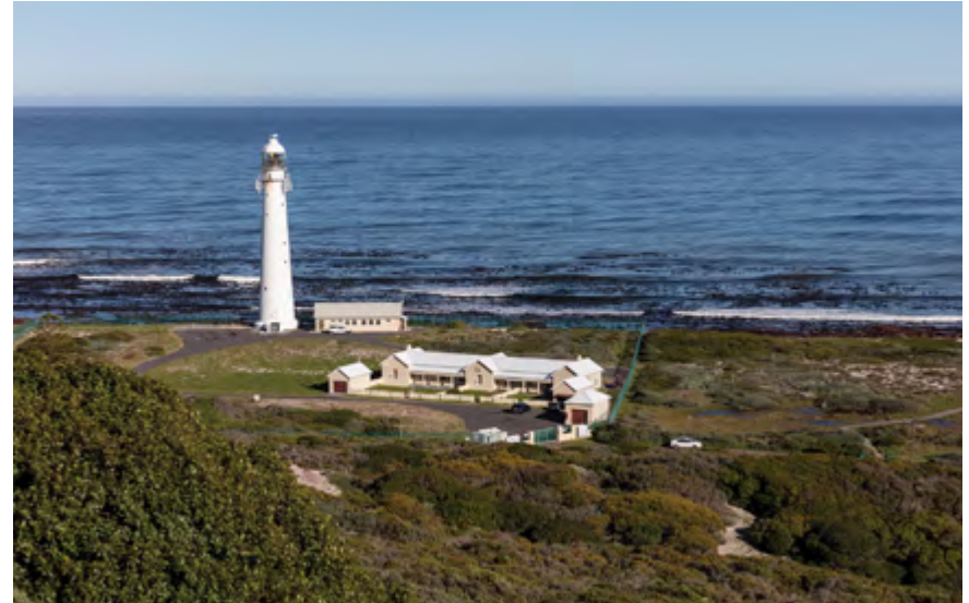
Explore the South Peninsula – Slangkop lighthouse at Kommetjie