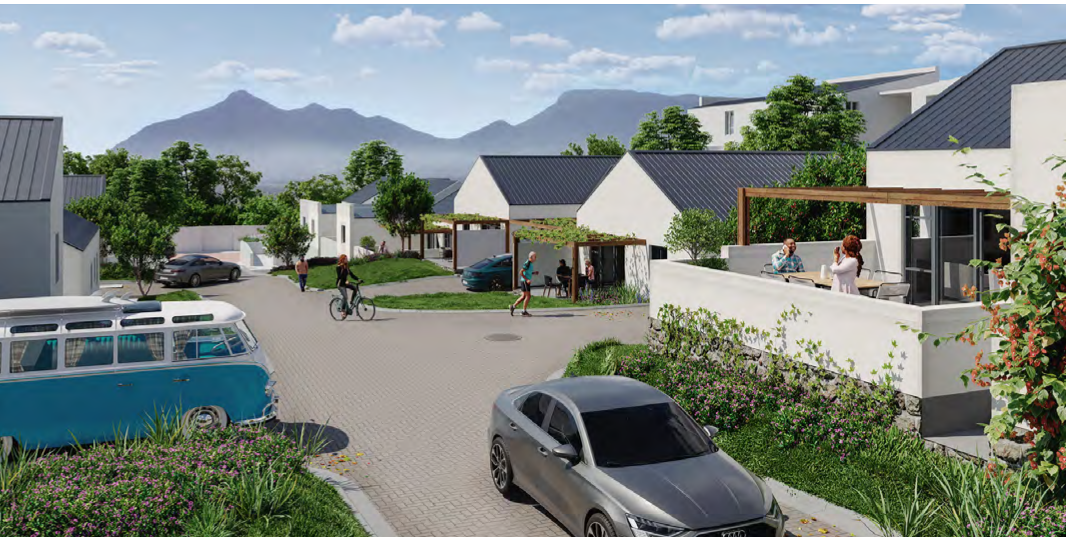
A typical street of luxury townhouses

Artist's impression only, for details visit: https://fynbosvillage.com/disclaimer/