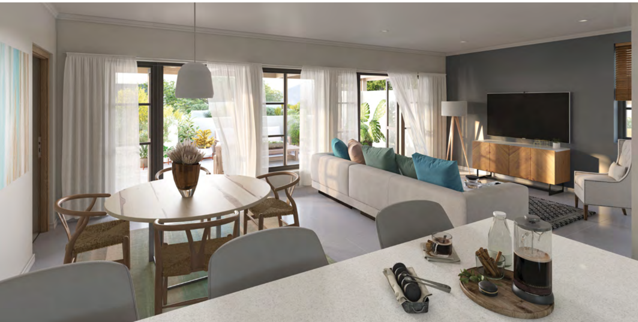
A typical townhouse open-plan living area

Artist's impression only, for details visit: https://fynbosvillage.com/disclaimer/