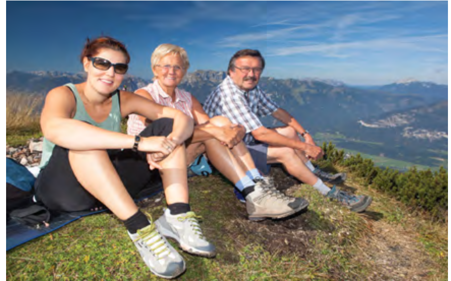
Stunning views reward hikes on the surrounding mountain peaks