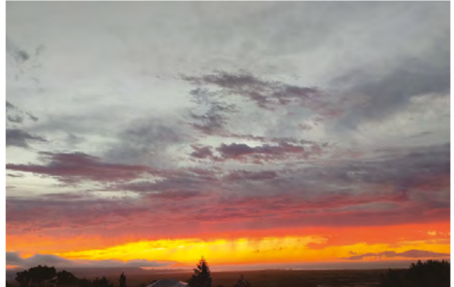
Sunset at Noordhoek beach